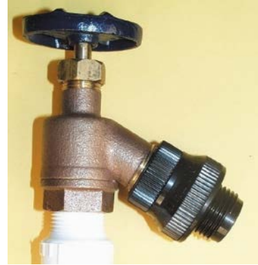
Vacuum Breakers are required on outside faucets